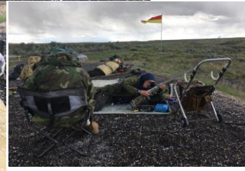
Left to Right Front Row